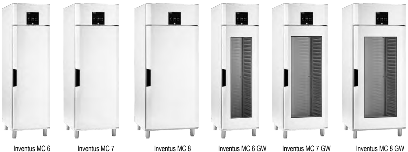
Inventus MC 6