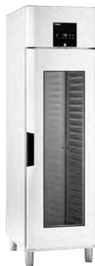
Inventus RC 6 GW