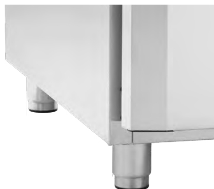
SHORT STAINLESS STEEL LEGS