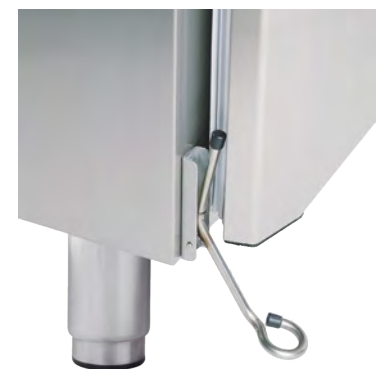
DOOR OPENING PEDAL