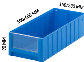
FLAT BOTTOMED PLASTIC STORAGE BOX