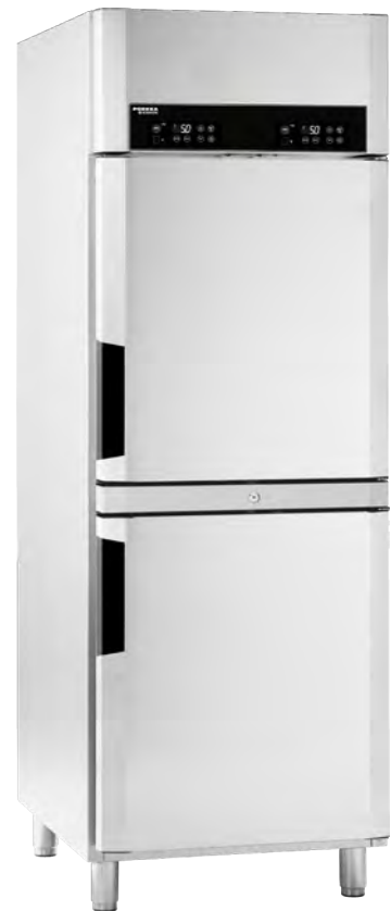
Inventus 7 MC/MF