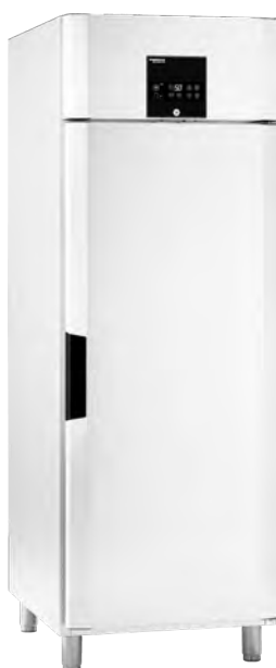
Inventus MF 7