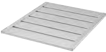
STAINLESS STEEL PANEL SHELF