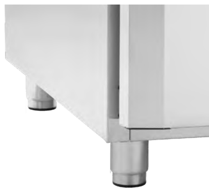
SHORT STAINLESS STEEL LEGS