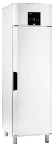
Inventus MF 6