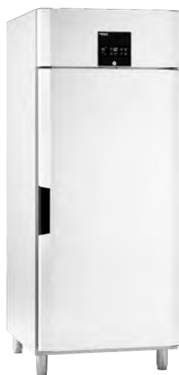
Inventus RC 8, RF 8