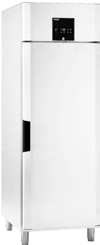
Inventus MC 7