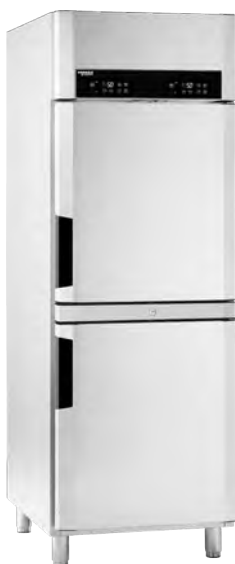
Inventus 7 MC/MF