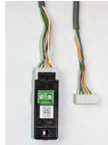
TTL/RS-485 DATA CABLE 0.5 M