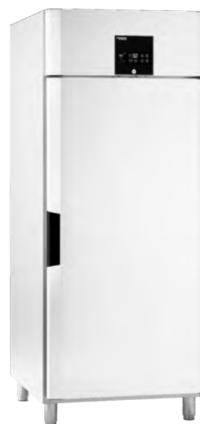
Inventus MF 8