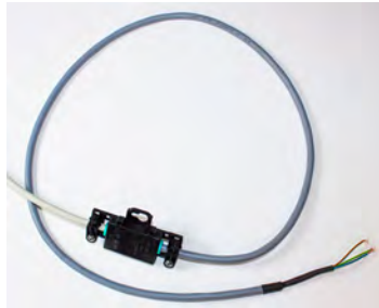
CENTRAL ALARM JUNCTION BOX