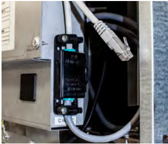
JUNCTION BOX AND CONNECTED ALARM CABLE (2.5 M) WITH RJ45 PLUG