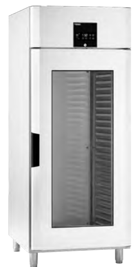
Inventus RC 8 GW