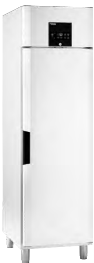
Inventus RC 6, RF 6