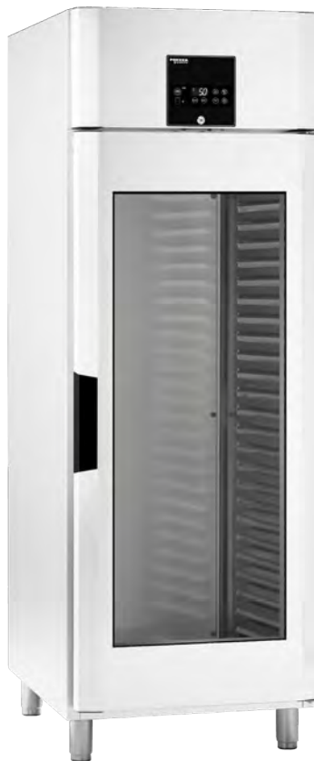
Inventus MC 7 GW