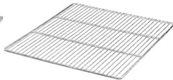
STAINLESS STEEL WIRE SHELF