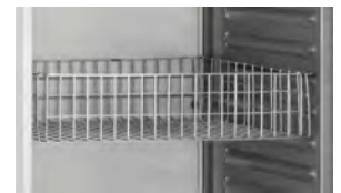
STAINLESS STEEL WIRE BASKET 8